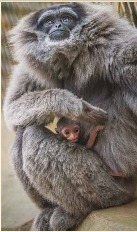
The new baby at Chester Zoo was born to mum Tilu and dad Alven.

Experts have put the unprecedented period of conservation breeding success down to a range of factors including natural habitats, skilled staff, ever improving levels of care and increasing scientific knowledge of threatened species.