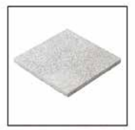
Silver Grey Granite Paving