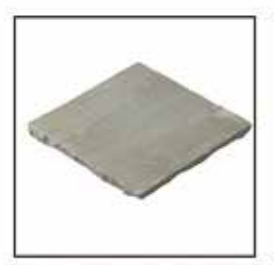
Calibrated Grey Sandstone

INDIAN SANDSTONE | GRANITE | PORCELAIN BLOCK PAVING | FENCING | SANDS DECORATIVE AGGREGATES | TOPSOIL WATER FEATURES | EDGING AND WALLING ARTIFICIAL GRASS | SOLID FUELS