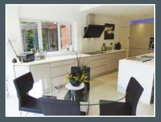
We pride ourselves on offering unrivalled advice and service, we will design your kitchen free of charge with materials from our premier partners.