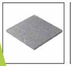
Blue Grey Granite Paving