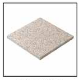
Pink Granite Paving