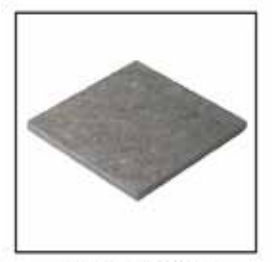
Black Basalt Paving

CED | HOOTON WORKS | HOOTON ROAD | HOOTON | CH66 7NB