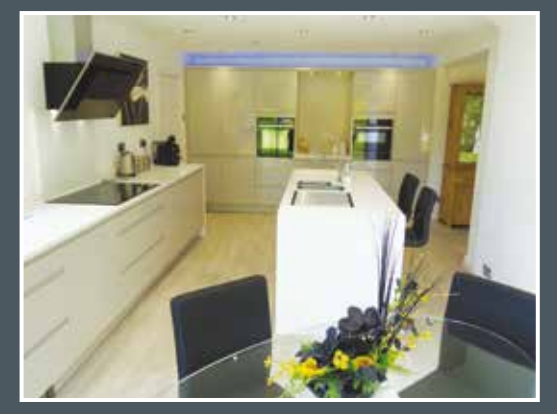
Our vast experience in not only designing kitchens but cooking in them as well enables us to design the perfect kitchen to suit your lifestyle and cooking needs.