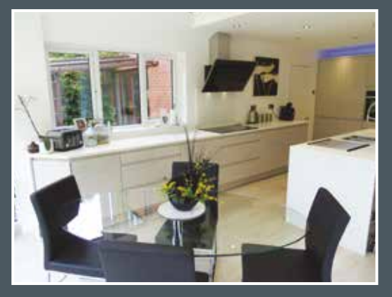
We pride ourselves on offering unrivalled advice and service, we will design your kitchen free of charge with materials from our premier partners.