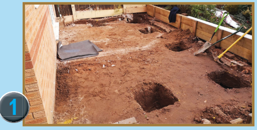
Install the concrete pads for the base, note no mess made.

With no need for a forklift, digger or skip means less mess and waste to deal with. In addition to that the cheaper cost when compared to traditional methods means Pure Conservatories offers homeowners a building system that delivers more.