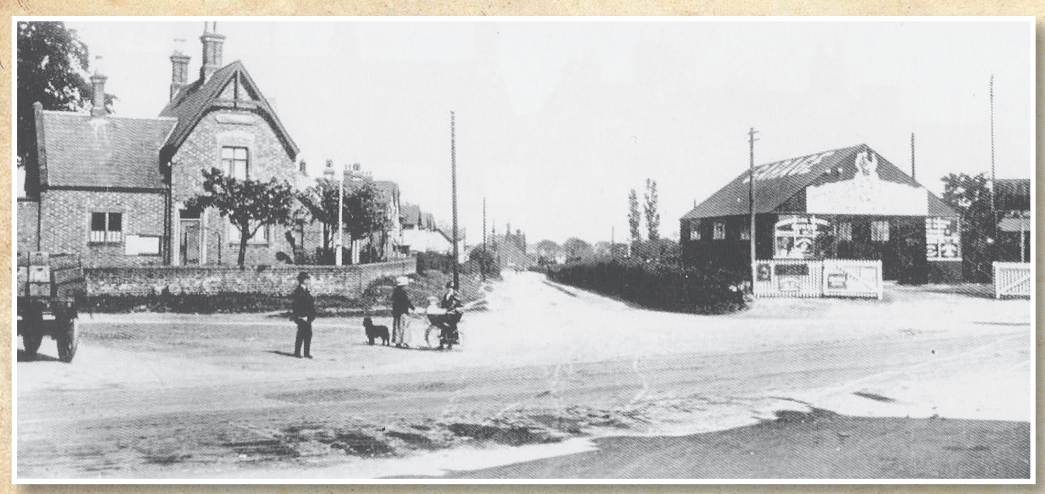
Above: Looking from Chester Road down Station Road, Little Sutton Railway Station can be seen in the distance. Sutton Motor Company, who advertise as 'Automobile Engineers' and who are 'Commercial Vehicle Experts', are seen on the right. The Police station can be seen on the left with the flagpole in front, closed in 1947.