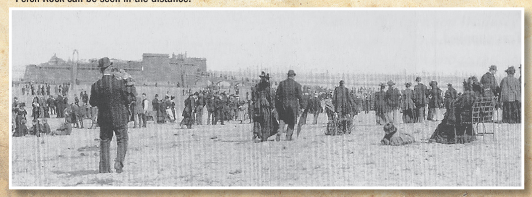
Below: 1902. The beach at New Brighton was a popular place to be seen, wearing hat and dark clothes. Fort Perch Rock can be seen in the distance.